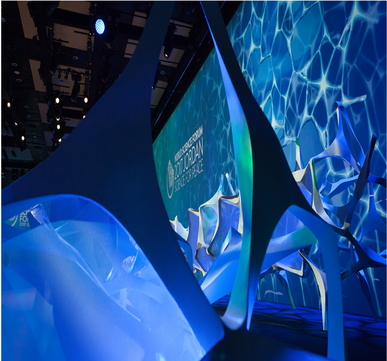
( http://www.thincdesign.com/uploads/projects/20171109-0138_WSF.jpg )